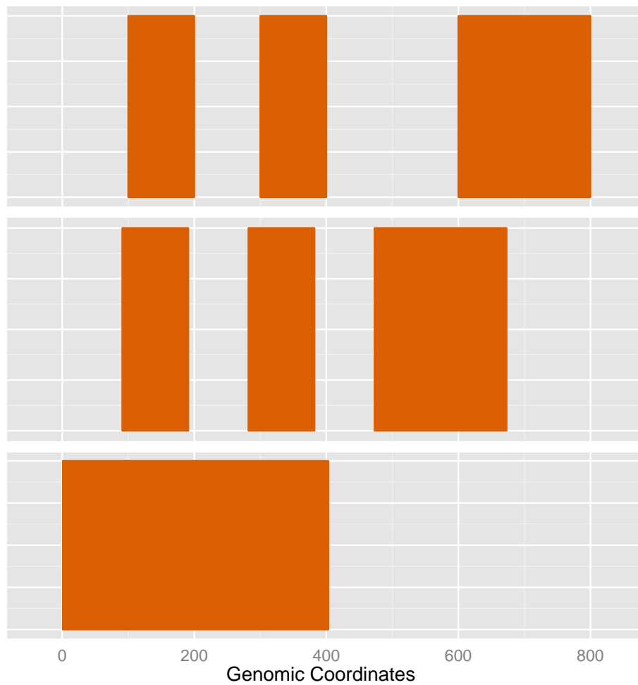
Figure 5: Shrink single GRanges. The first track is original GRanges, the second one use a ratio which shrink the GRanges a little bit, and default is to remove all gaps shown as the third track